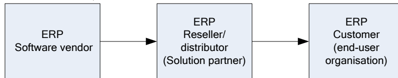
Figure 1 Stakeholders in the ERP value-chain

ERPs are developed in what could be described as a value-chain, consisting of different stakeholders as described in Figure 1. The value-chain can be described as the ERP business model, and it can be stated that the ERP business model at least involve three different stakeholders, who can be labelled as: ERP software vendor, ERP reseller/distributor, and ERP customer or end-user of ERP.